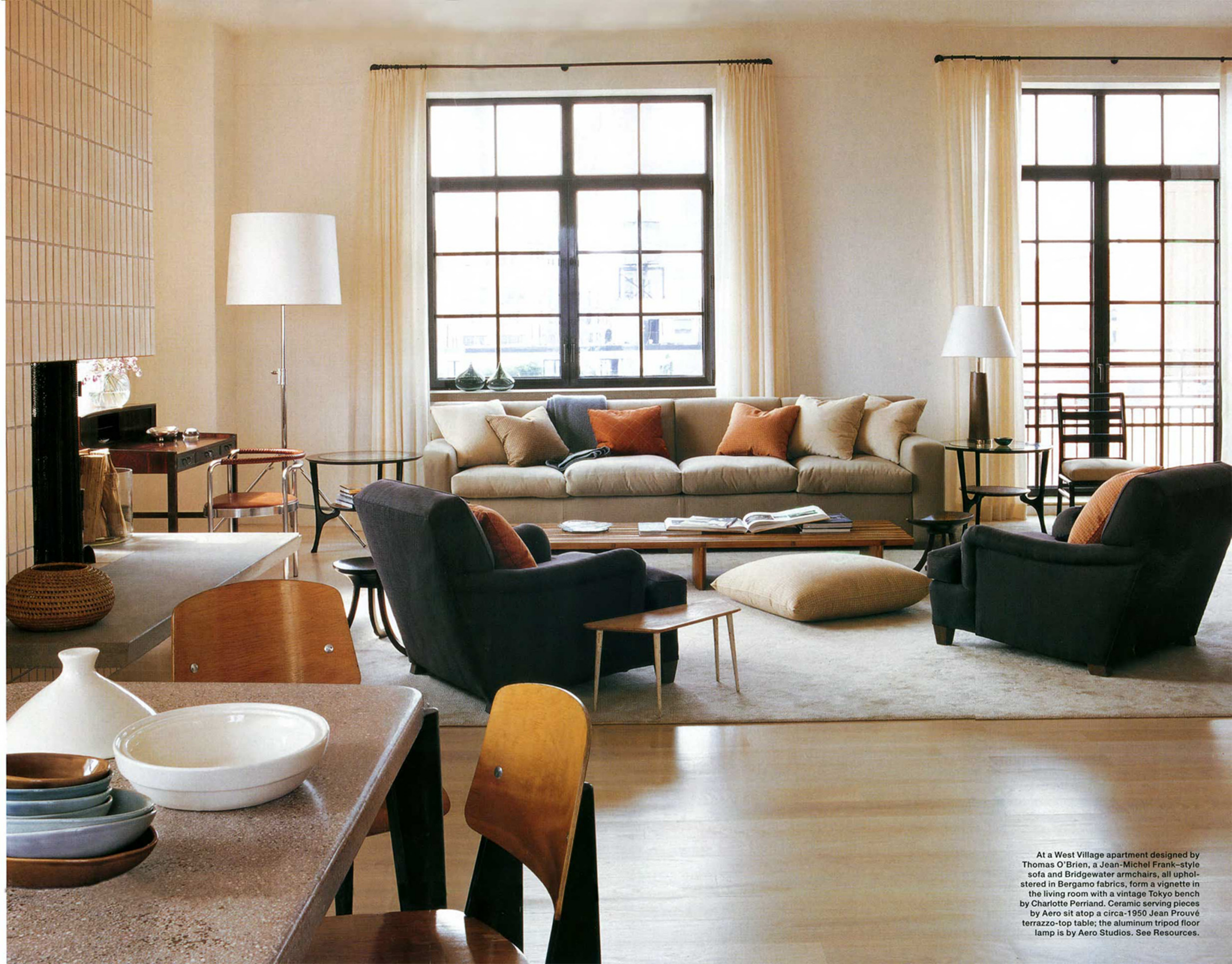
At a West Village apartment designed by Thomas O'Brien, a Jean-Michel Frank-style sofa and Bridgewater armchairs, all upholstered in Bergamo fabrics, form a vignette in the living room with a vintage Tokyo bench by Charlotte Perriand. Ceramic serving pieces by Aero sit atop a circa-1950 Jean Prouvé terrazzo-top table; the aluminum tripod floor lamp is by Aero Studios. See Resources.

"We used to sort of perch on the furniture and run out to dinner," the wife recalls with a laugh. But with a baby on the way, their lives were changing, and they needed more than a perch. Buying a place in the West Village and starting from scratch, the cou-